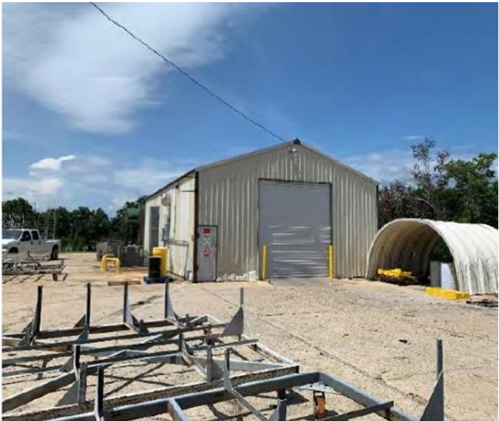
CHEMICAL STORAGE BUILDING