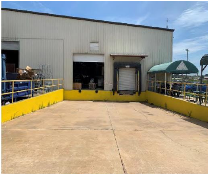
DOCK HIGH LOADING