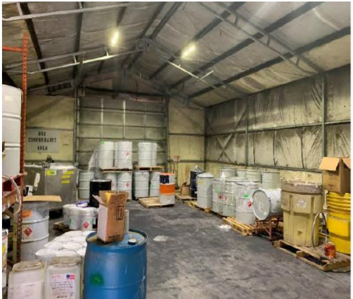
CHEMICAL STORAGE BUILDING